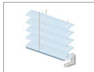
Tensioning angle bracket for installation on window casement