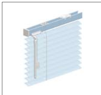
Control with draw-cord, tilting of slats via tilting wand