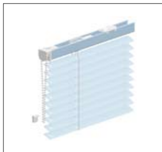
Control and tilting of slats via draw-chain, lateral chain outlet