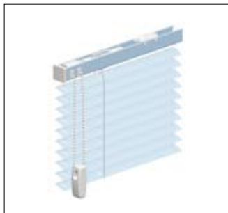
Control and tilting of slats via draw-chain, chain outlet in front