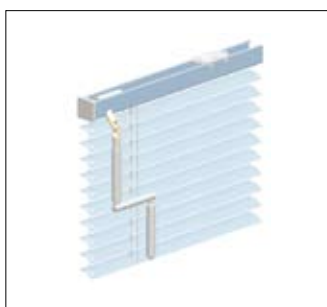
Control and tilting of slats via hand crank