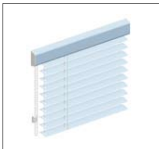
Control and tilting of slats via draw-chain, lateral chain outlet (Model ISOLINE)