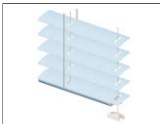
Tensioning shoe for installation on the glass frame